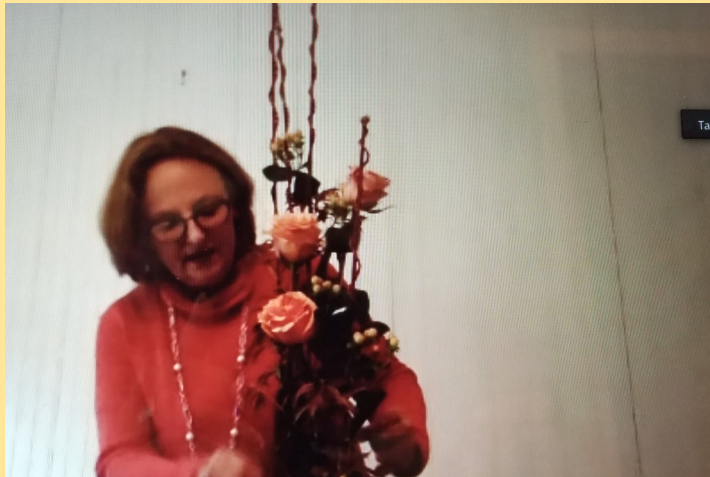
A Line Design with roses and japonica.