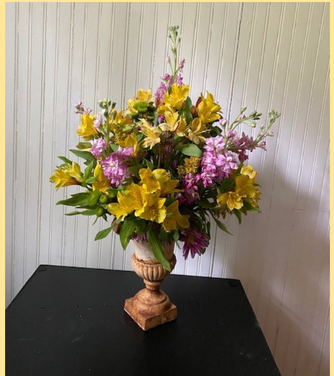
Flowers in urn are alstroemeria, scabiosa, stock, solidago and mini pom.