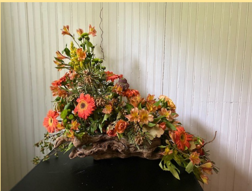
A Creative Mass design set on a wood piece.

Flowers include alstroemeria, azalea, gerbera daisy, mini button pom poms, scabiosa, solidago, spray roses, and umbrella pine.